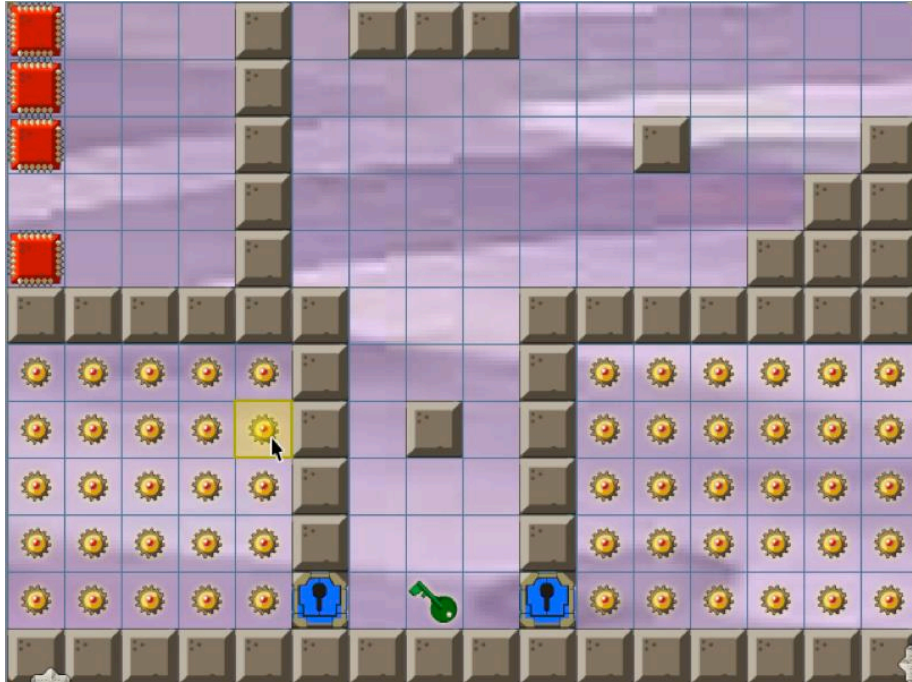
Figure 1. Screenshot of video game: The coins represent signatures to be collected for the anti-bullying campaign.